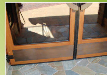
VEKA's Euroview PVC windows and doors provide superior energy efficiency and sound transmission control. Attractive high quality hardware provide years of smooth trouble free operation.