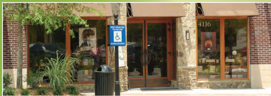
VEKA's Euroview window and door systems are the smart choice, classic design and an economical solution.