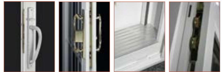
Color matched hardware Optional brass hardware Aluminum threshold cover Stainless steel roller